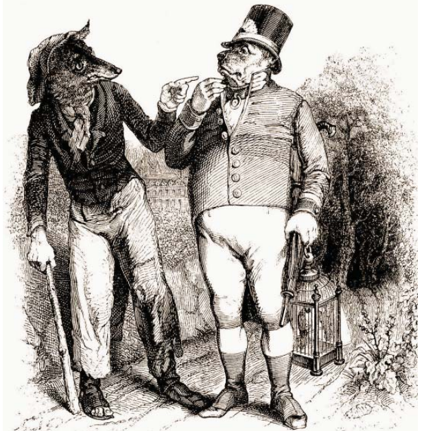
Illustrations by J.J. Grandville. Anthropomorphic animals have been used to tell stories for centuries.

The word "anthropomorphic" (literally "human-shaped") refers to animals or objects given human characteristics. Anthropomorphic animals include everything from the gods of ancient Egypt with their dog, cat, and crocodile heads, to the tool-using characters of the Sonic the Hedgehog video games, to the talking sea creatures of the SpongeBob Squarepants television series.