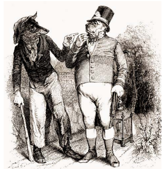
Illustrations by J.J. Grandville. Anthropomorphic animals have been used to tell stories for centuries.

The word "anthropomorphic" (literally "human-shaped") refers to animals or objects given human characteristics. Anthropomorphic animals include everything from the gods of ancient Egypt with their dog, cat, and crocodile heads, to the tool-using characters of the Sonic the Hedgehog video games, to the talking sea creatures of the SpongeBob Squarepants television series.