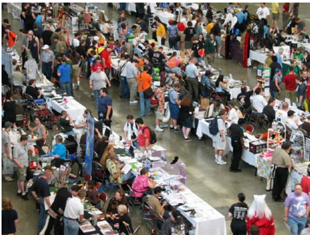
Anthrocon Dealers' Room. Anthrocon is the largest convention of its type in the world. Attendees of all ages come to Anthrocon to attend workshops and seminars, buy and sell artwork, exhibit costumes, and socialize.

Anthrocon is a Pennsylvania-incorporated 501(c)7 not-for-profit organization. As a not-